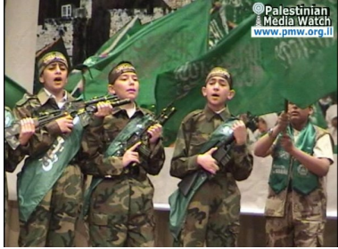
Hamas children trained to hate Israel

Jordan Today: Jordan became a nation in 1946, and adopted the name of Jordan in 1950. They were one of the nations to attack Israel on the first day they became a nation in May 1948. The population numbers about 5.9 million, with 92% being Muslim, and 98% Arab. They along with Egypt signed a peace agreement with Israel. According to some statistics, as many as 3.0 million Palestinians make up the population of Jordan.