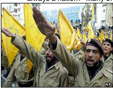
Hezbollah militants of Lebanon salute

How did these nations emerge? Wasn't Syria, Egypt, Persia, Arabia, Palestine and Jordan always a nation? Many of the nations in the Middle East emerged after the fall of the Ottoman Empire.