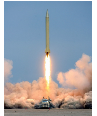
Iran's Shahab-3 missile capable of hitting Israel

coming of the Shia "Messiah", the Mahdi. They believe Mahdi along with Jesus will vanquish the enemies of Islam, including the West and the Jews.