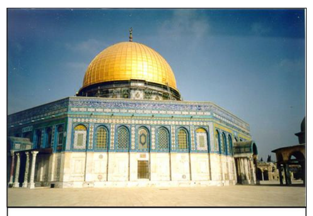
The Dome of the Rock, Location of the Jewish Temple

God's prophetic program: The Temple of the Dome of the Rock