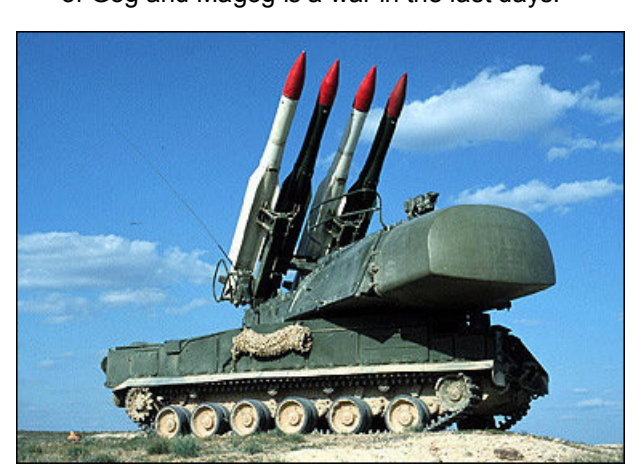
Tor M1 missiles supplied to Iran by Russia to protect them from an Israeli or US strike against their nuclear

The miracle of the nation of Israel, cannot be under estimated. Ezekiel, 2600-years ago, along with the other prophets of the Bible, foretold of a national rebirth of Israel, gathered from the nations (Ezekiel 36-37). Ezekiel followed this by describing a confederation of nations who would attack a reborn, nation assembled out of the nations in Ezekiel 38 and 39. This event, known in the Bible as the battle of Gog and Magog is a war in the last days.