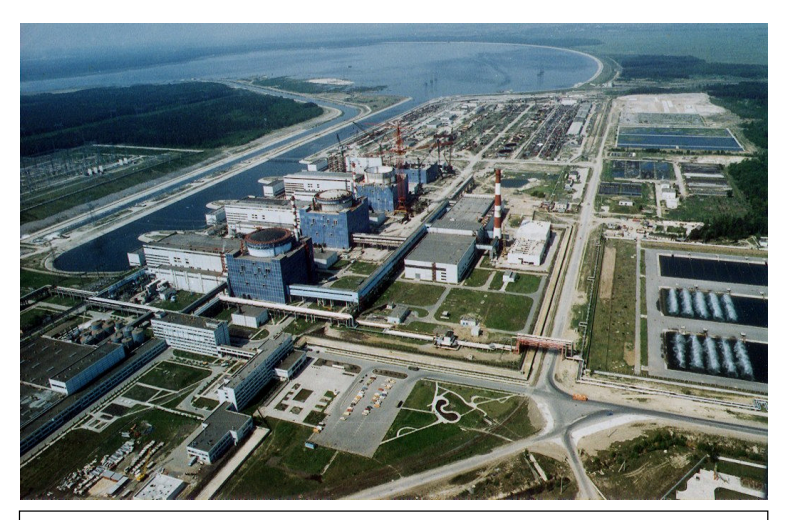
The Bushehr nuclear built for Iran by Russia

What role does Islam play in the world? And what is the final outcome of Islam? These questions continue to come to mind to those who see the conflict between Islam and the West rise. One cannot help but see the series of conflicts all around the world. and see the role Islam plays.