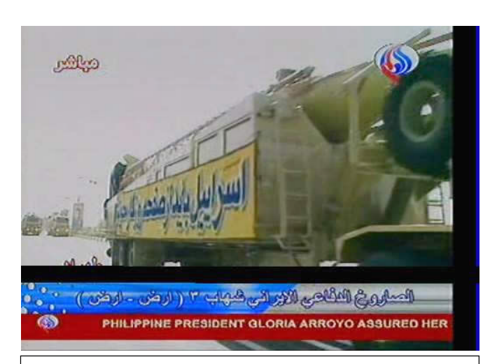
"Israel must be uprooted and erased from history"

Introduction to Gog and Magog and Israel