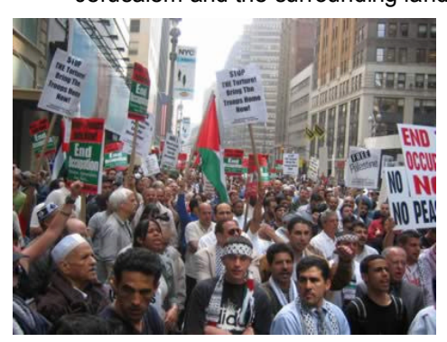
Al Nakba, the Great Catastrophe, mourns the creation of Israel

This was not the first time a resettled Jewish population faced a gauntlet of opposition. Twenty-five-hundred years ago, the Jews faced similar opposition following the Babylonian captivity (605-539 B.C). Cyrus the Great, the Persian king who defeated the Babylonians allowed the Jewish captives to return to the land (Ezra 1:1-3). As the Jews migrated back to the land, the people who had occupied Jerusalem and the surrounding lands in their absence did not welcome their arrival. A struggle ensued.