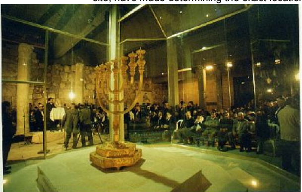
Menorah prepared for the Third Temple by the Temple Institute

The Sanhedrin heard expert testimony on the various opinions as to the exact part of the Temple Mount upon which the Holy Temple stood. The fact that there has never been an archaeological expedition or dig on the Temple Mount, coupled with continuous Muslim efforts to destroy historical evidence of the Holy Temple at the site, have made determining the exact location difficult.