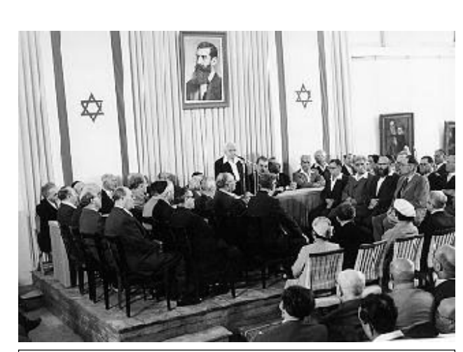
On the day, May 14<sup>th</sup> 1948, the State of Israel was declared

33 Thus says the Lord God: "On the day that I cleanse you from all your iniquities, I will also enable you to dwell in the cities, and the ruins shall be rebuilt. 34 "The desolate land shall be tilled instead of lying desolate in the sight of all who pass by. 35 "So they will say, 'This land that was desolate has become like the garden of Eden; and the wasted. desolate, and ruined cities are now fortified and inhabited.'