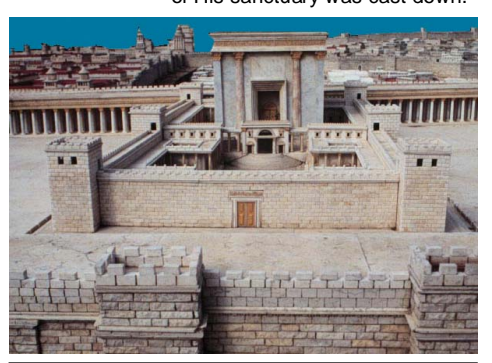
Model of the Temple at the time of Herod

"Abomination", an idol, caused the Temple to be "Desolated". This is precisely what the First book of Maccabees calls it, the Abomination of Desolation.