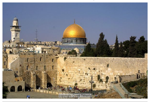
Dome of the Rock with Wailing Wall

27 "For as the lightning comes from the east and flashes to the west, so also will the coming of the Son of Man be. 28 "For wherever the carcass is, there the eagles will be gathered together.