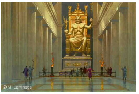
Statue of Zeus at Olympus, a similar looking one was probably installed in the Temple

Daniel prophesied about the act of Antiochus Epiphanies <sup>1</sup>, who would do precisely that by setting up an image of Zeus in the Temple, and offering a pig as a sacrifice. This setting up an