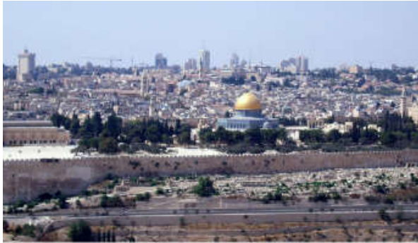
Temple Mount View from the Mount of Olives

Before Jesus was crucified he spent time with his disciples explaining to the events after his death, leading to his 2 nd Coming. These events were spelled out point by point detail, from his rejection to Today. Jesus was with his disciples in the Temple; from there he walked over to the Mount of Olives , at the Mount of Olives he explained what would happen after he was killed.