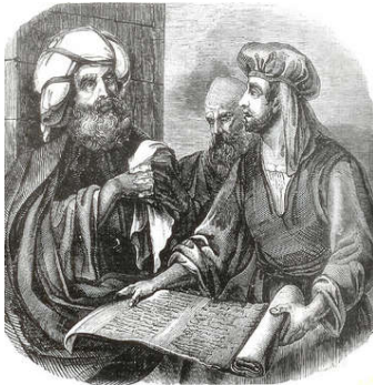
Bar Khochba was declared the Messiah by the leading Rabbi of the day in 132 AD. 580,000 Jews were killed when he led a rebellion against Rome.

(5) For many will come in my name, saying, 'I am the Christ,' and they will lead many astray.