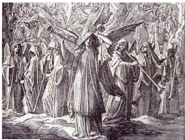
OPENING OF THE SEVENTH SEAL. Rev. viii. 1-6.