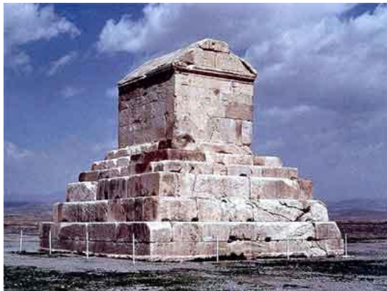
Tomb of Cyrus

Darius the Mede... Darius the meade, is made governor by the conquering Persian and Meade armies. Cyrus however is the king, Darius ruled over the province of Babylon. Heroditus gives us details not covered in the Bible of how Cyrus defeated Babylon.