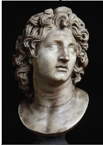
Alexander the Great defeated Persia and died in Babylon (323 B.C.)

After you.... Daniel chapter 5 records the defeat of Babylon by Persia in 539 B.C. Persia is the second kingdom after Babylon. The silver chest and arms represent this kingdom.