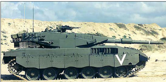
The Merkava 4, the main battle tank in Israel takes its name from the Hebrew word for chariot

(1) Then I turned: Zechariah is still in the vision, from the first chapter. He just seen the two women with wings like storks carry off the women, called wickedness to the land of Shinar (Babylon) (Zechariah 5). As the ephah is taken away, Zechariah turns to see four chariots coming from between two bronze mountains.