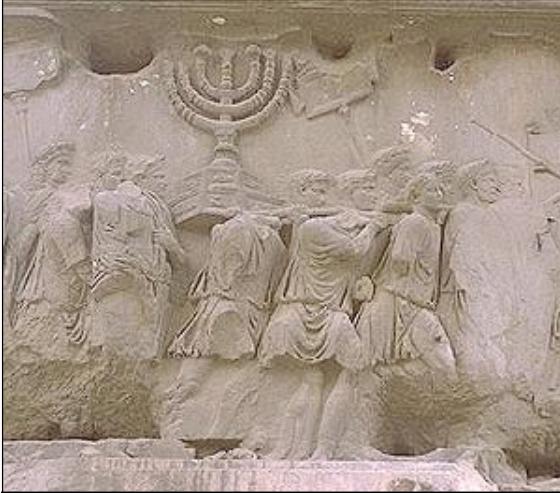
Menorah (Lampstand) taken from the 2 nd Temple by armies of Rome, A.D. 70. From the Arch of Titus