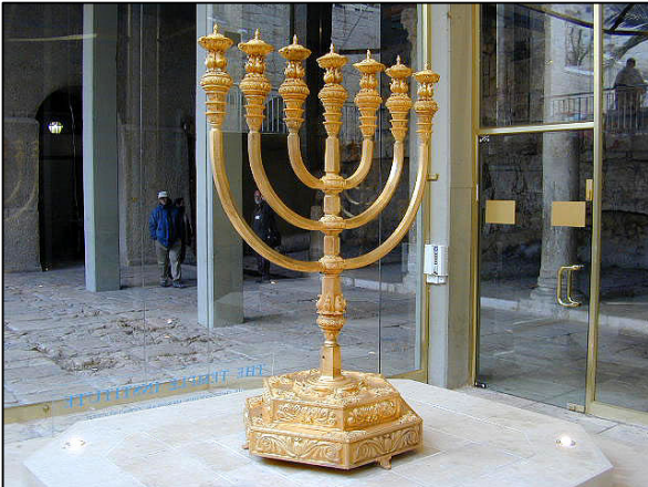
The Menorah prepared for the 3 rd Temple, yet to be constructed.

Solid gold: The Temple's Menorah and Zechariah's Menorah made from solid gold, symbolize the light of God's truth to the world. Gold symbolizes holiness and purity.