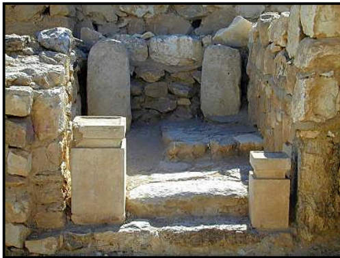
High places of ancient Israeli city of Arad

casting down arguments: The word argument in Greek is λογισμοῦ Logismos , means logic or understanding. We are to pull down false ways of thinking, or false reasoning. This covers a very broad spectrum on both small and large scales. Many of our "isms" are essentially spiritual strongholds of false reasoning. Take your pick, Communism, Hinduism, Alcoholism, Atheism, Racism and more are all forms of logic, which make sense to the people entrapped. We are called to cast down or destroy this false logic.