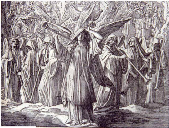
OPENING OF THE SEVENTH SEAL. Rev. viii. 1-6.

The trumpet judgments in Revelation chapters 8 and 9 take place in the first half of the tribulation. The first four trumpet judgments involve catastrophes to the physical earth. Burning hail, asteroids and smoke devastate the earth in the four trumpet judgments of chapter 8. These plagues strike the earth at the direction of the "Two witnesses" in Jerusalem, calling down God's judgments. Following these physical judgments in chapter 8, spiritual judgments take place in the 5 th and 6 th trumpets in chapter 9.