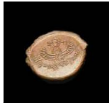
The seal of King Hezekiah

Open the scroll Only the person worthy could open the sealed scroll. Here the picture of kinsman redeemer comes to mind. The position of kinsman, was a relative who had the resources to "Redeem" or purchase what his relative lost. The angel is making the offer to the universe, is someone able to take possession of the sealed scroll?