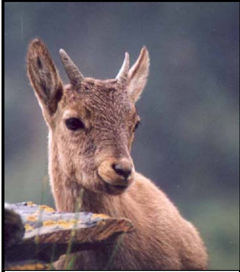
He had two horns like a lamb but spoke like a dragon