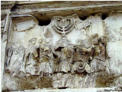
From the Arch of Titus, celebrating the destruction of The Second Temple in A.D. 70

The Temple of God... The mention of the Temple is very significant. Titus originally destroyed the Temple in 70 AD and the 3rd most holy spot to Islam, the "Dome of the Rock", now occupies its location. John's, measuring the Temple here in chapter 11, is cause for debate. Those who understand the book of Revelation from a "Preterist" 1 view (Latin for past) interprets the Temple John is measuring as Herod's Temple. The one destroyed by Titus in 70 AD. For the Preterist, view to be correct John would have had to written the book of Revelation before 70 AD. However, John imprisonment on Patmos took place closer to 90 AD, during the persecution of Domitian.