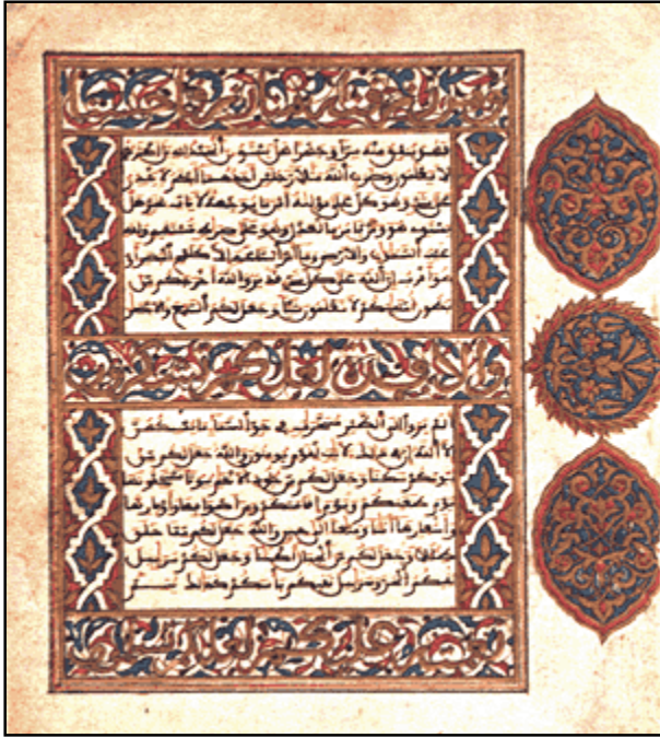
A page from the Arabic Qu'ran