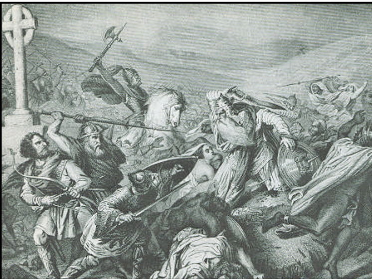
Battle of Tours, Islam vs. the West 732 AD.

to bypass Muslim controlled areas in the Indian Ocean, found the passageway to Asia via the Atlantic Ocean.