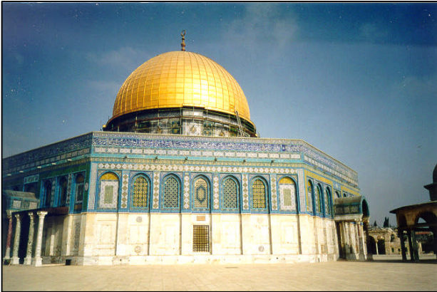
The Dome of the Rock, Location of the Jewish Temple

Allah hath purchased of the Believers their persons and their goods; for their (in return) is the Garden (of Paradise): they fight in His Cause, and slay and are slain: a promise binding on Him in Truth, through the Law, the Gospel, and the quran QurYan: and who is more faithful to his Covenant than Allah? Then rejoice in the bargain which ye have concluded: that is the achievement supreme.