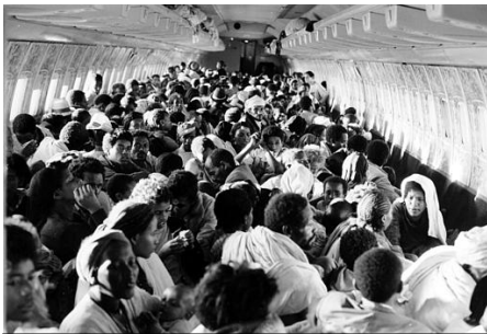
Jews gathered from Ethiopia fulfilling Isaiah 11:11

The gathering of the Jews in Israel today was foretold 3400 years ago, even before Israel ever possessed the land of Israel. One of the most prophesied events in scripture is the end times gathering of Israel. (See Jeremiah 30:3, Isaiah 11:10-16, Isaiah 14:2, Ezekiel 36-37, Joel 3:1-2) Ezekiel writes,