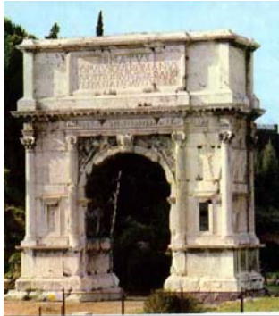
Arch of Titus celebrating Roman victory over Jerusalem

years after Titus, Hadrian massacred another 580,000 Jews who had rebelled against Rome. Hadrian was determined to erase the history of the Jewish people from the world. Hadrian renamed Jerusalem and Judea, Jews were no longer allowed in the area. The people of Israel were scattered throughout the Roman Empire fulfilling the words of Moses written 1400 years earlier.