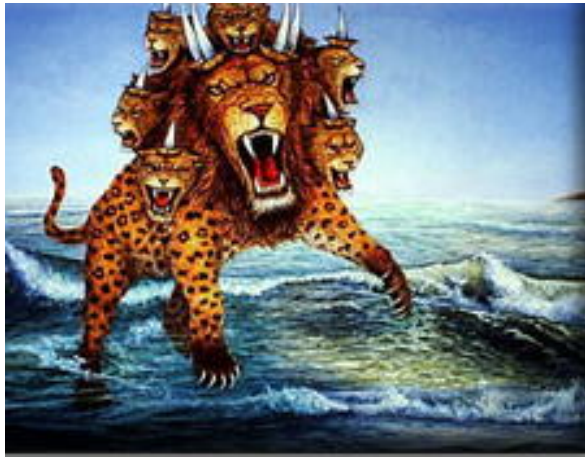
John describes the kingdom of the Antichrist as a seven-headed, ten-horned Beast (Revelation 13:1-3)

The last half of the Tribulation begins when the Antichrist and the False prophet after failing to destroy Israel, then begin to persecute the offspring of Israel, both Jews and believers in Christ (Revelation 12:17). After Temple worship is stopped (Daniel 9:27), the Two Witnesses killed (Revelation 11:8), The Antichrist installs an image of himself in the Jewish Temple, the Abomination of Desolation (Matthew 24:15), the whole earth is forced to choose between life and death, Satan or Christ. The Antichrist proclaims himself god and demands worship from the earth.