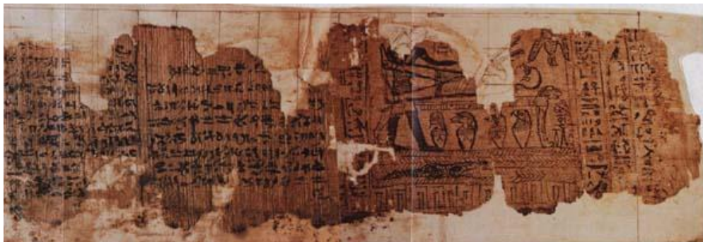
The Egyptian Papyri scroll Joseph Smith claimed authored by Abraham, and translated in English by Smith into the Book of Abraham, in the Pearl of Great.

The first “Prophet” of the Mormons is Joseph Smith. From a few followers after the publication of the Book of Mormon , the Church of Jesus Christ of the Latter Day Saints has grown to over 12 million with the latest statistics. They are sending thousands of missionaries to reach the “Christian” world with the “Restored” Gospel revealed in the “Book of Mormon”.