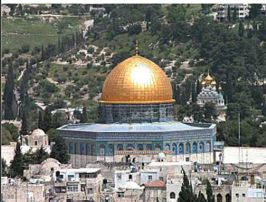
Dome of the Rock

Ezekiel wrote these words 2600-years ago, referring to the Jewish people who would be gathered back to the land of Israel in the latter years (Last years) after a long period of desolation (almost 2000-years) from A.D. 70 to 1948.