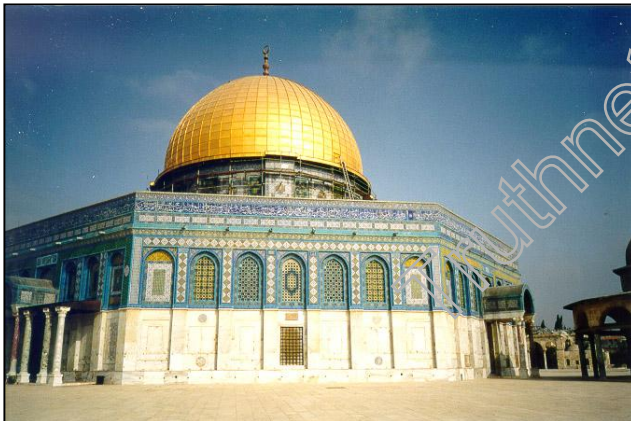
The Dome of the Rock, Location of the Jewish Temple

Allah hath purchased of the Believers their persons and their goods; for their (in return) is the Garden (of Paradise): they fight in His Cause, and slay and are slain: a promise binding on Him in Truth, through the Law, the Gospel, and the quran Qur'ān: and who is more faithful to his Covenant than Allah? Then rejoice in the bargain which ye have concluded: that is the achievement supreme.