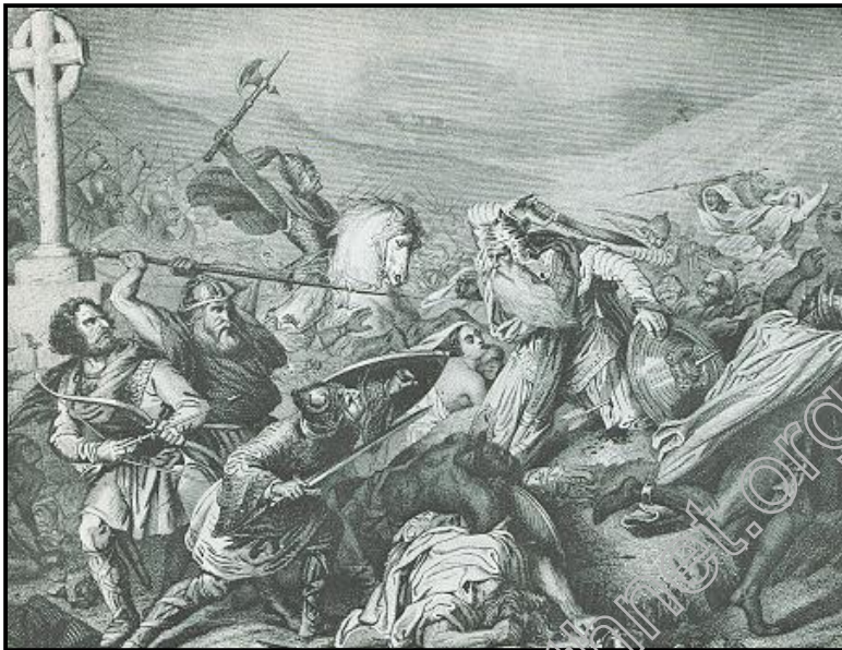
Battle of Tours, Islam vs. the West 732 AD.

In the Battle of Tours Charles Martel the grandfather of Charlemagne defeated the advancing Muslim armies. From Tours Muslim power in Europe retreated and in the 1489 Fredinand and Isabella of Spain defeated the last remaining forces in Spain. Later, the Ottoman Empire would retreat from the rest of Europe.